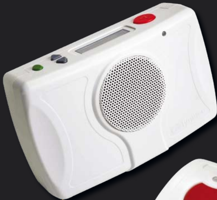
Aid Link 5000

The Aid Link 5000 alarm unit also offers true Telecare facilities by storing all alarm and activity data in local memory. This data can be downloaded and analysed remotely using its built-in high speed modem and specialist care software. The Aid Link 5000 also retains the alarm signalling capabilities of traditional dispersed alarm units to ensure compatibility with existing Alarm Receiving Centres.